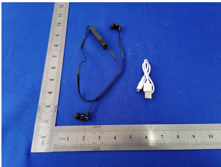
Photo 2 General appearance of EUT