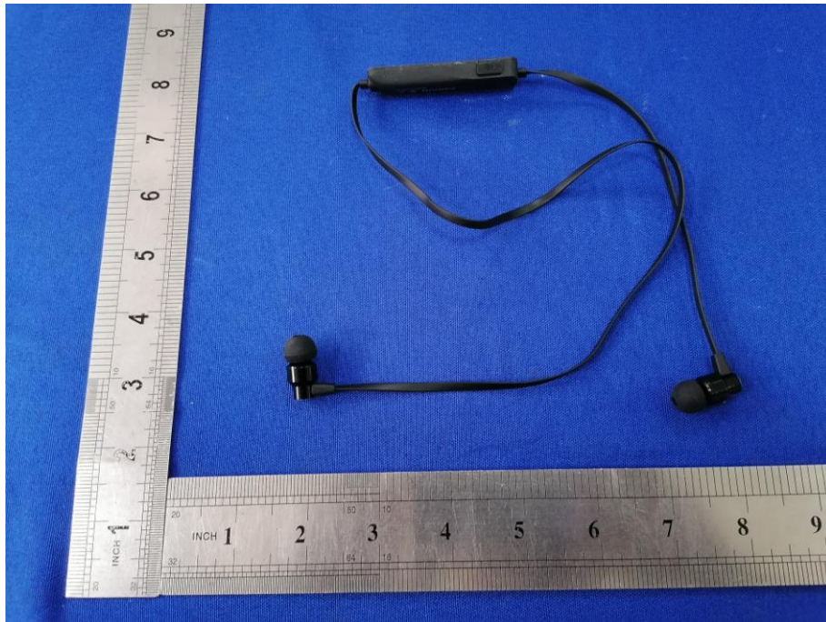
Photo 4 General appearance of EUT